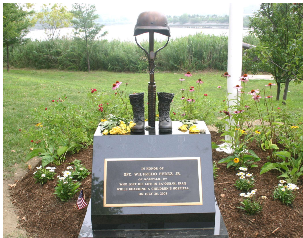
Junior’s memorial along the trail at Oyster Shell Park, Norwalk, CT Dedicated July 28, 2007

We established this Fund in my son’s name and honor with three primary goals: